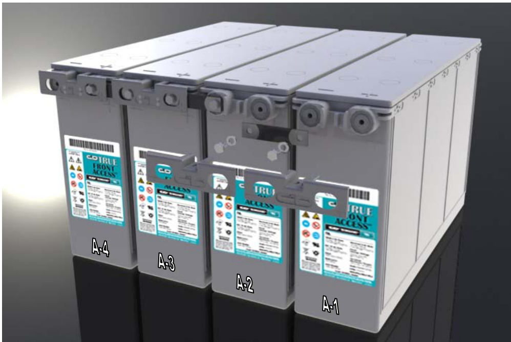
Figure 3 – Single -48 volt string configuration (typical)

Front access batteries are heavy, typically over 100 pounds each. Make sure proper lifting and moving arrangements are in place to safely handle this weight and have been considered before traveling to the site.