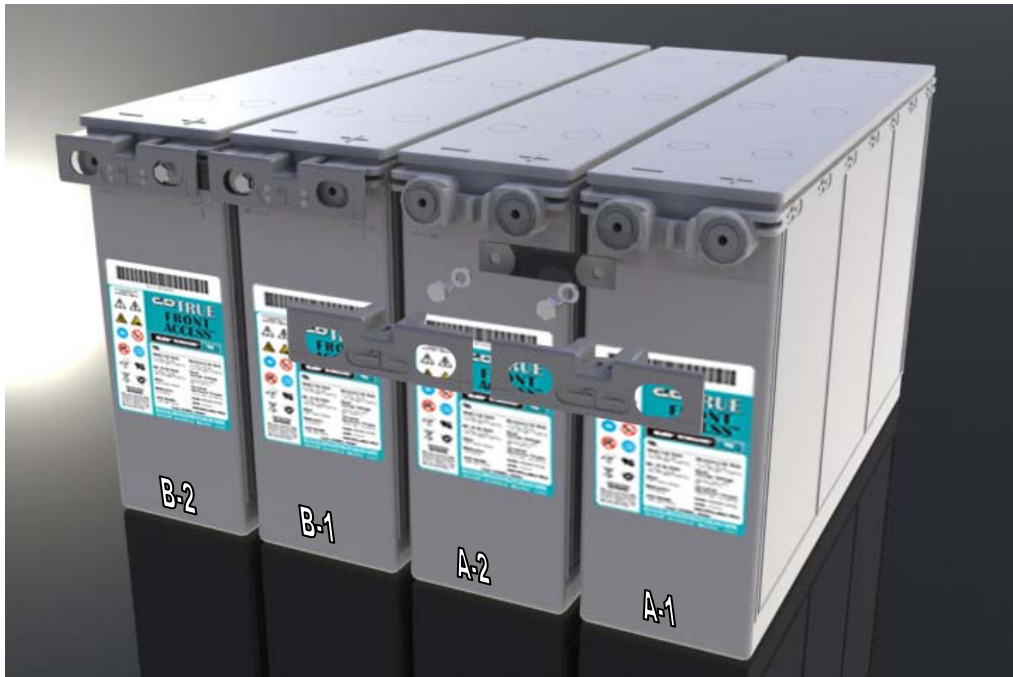
Figure 4 – Series +24 volt string configuration (typical) 2 strings to be in parallel shown

Step 12. Verify charging equipment is set for proper float voltage of 2.25 to 2.30 volt per cell at 77°F at the battery terminals (54 to 55.2Vdc for a nominal 48 volt battery).