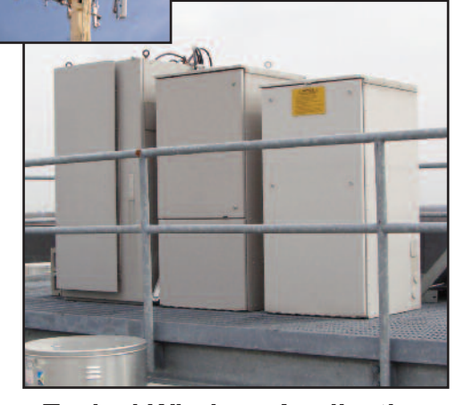
Typical Wireless Application