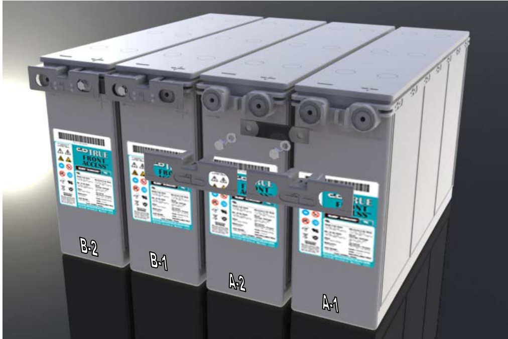
Figure 4 – Series +24 volt string configuration (typical) 2 strings to be in parallel shown

Step 12. Verify charging equipment is set for proper float voltage of 2.25 to 2.30 volt per cell at 77F at the battery terminals (54 to 55.2Vdc for a nominal 48 volt battery).