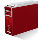
NSB 40FT HT RED